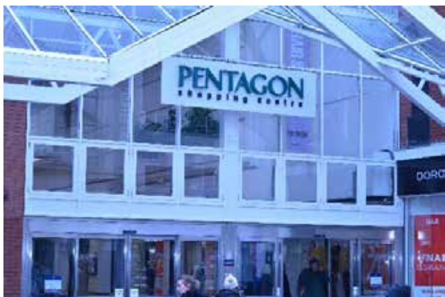
From High Street

You will enter Pentagon Shopping Centre through one of 4 entrances.