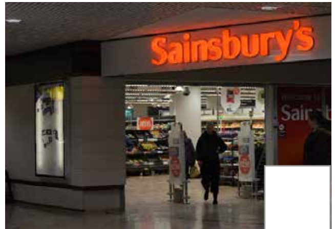
Sainsbury's – Pentagon Court