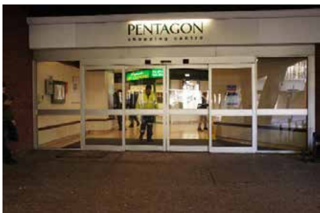
From Taxi Rank