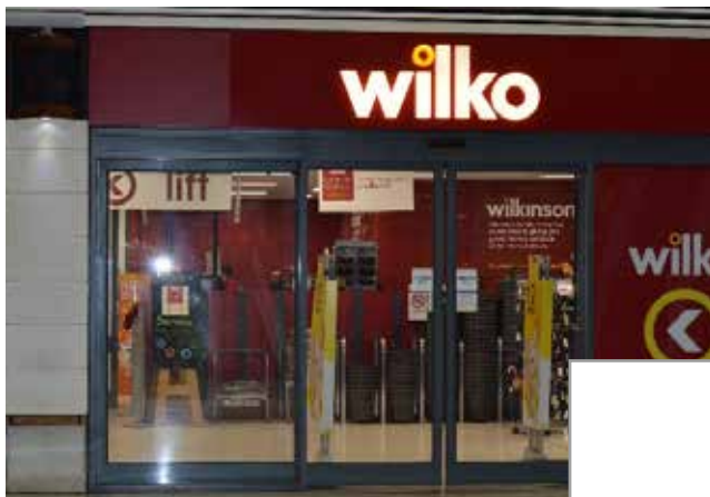
Wilko's – Pentagon Court