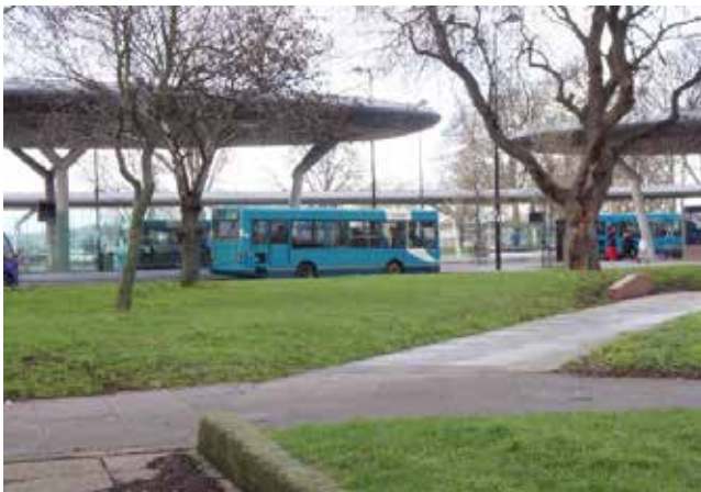
Chatham Waterfront Bus Station