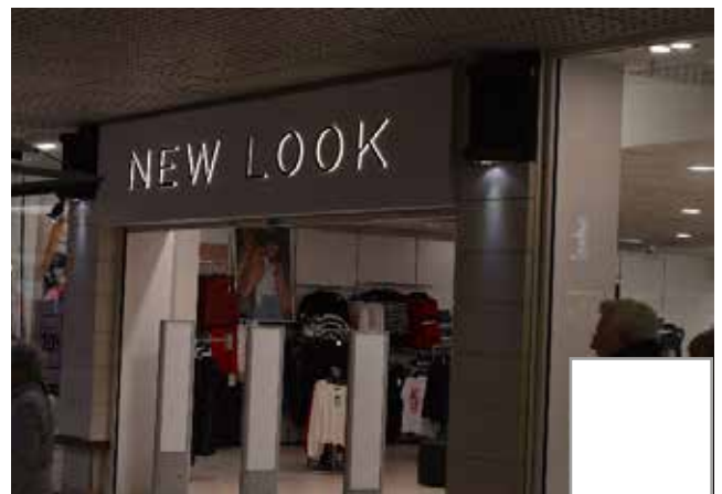
New Look – Link Mall