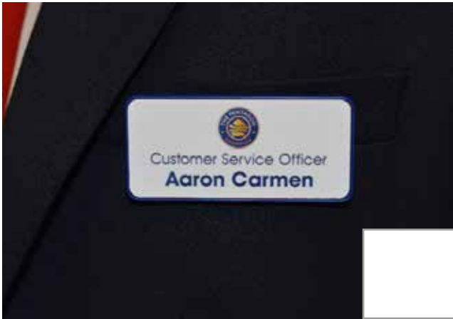
Customer Service Officers