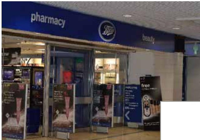
Boots – Fair Row

There are lots of shops at Pentagon Shopping Centre. Here are our four biggest shops.