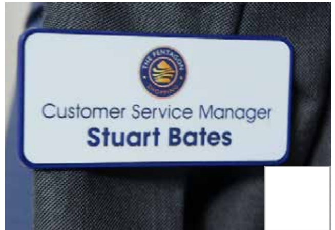
Customer Service Manager