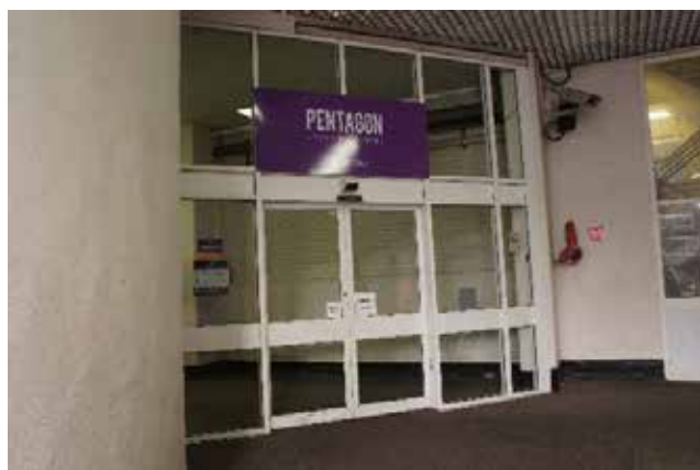
From Solomon's Road