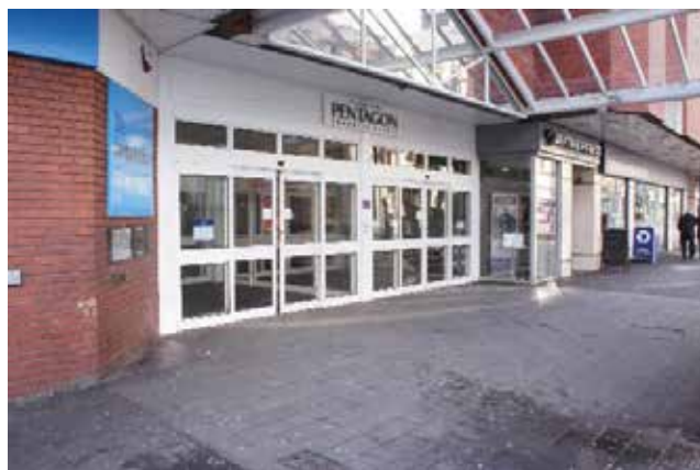
From Military Road